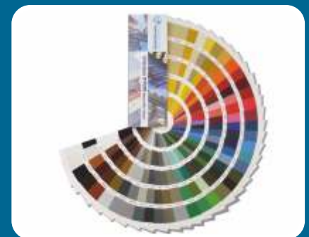
Available In 200+ Colours